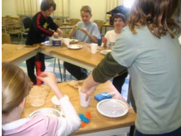
Earth Crusaders at Work

Fashionistas: This workshop was presented by each of the monitors with their group. Students were asked to create their own brand of clothing to suit their personal style. Then they got to create a t-shirt with their logo.